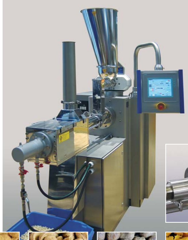
Extruder OEE 8 with hydraulic ram for laboratory use or for small-scale productions

At the start of production the KAHL OEE Extruder does not require an increased liquid addition and can be started with an "open" die. It is less sensitive and the quantity of wasted product is reduced considerably compared to traditional extruders. Depending on the product, the KAHL OEE Extruder is equipped with heating and/or cooling jackets, pressure and temperature measuring devices.